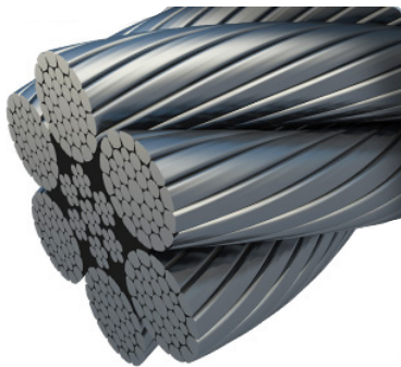
Bridon Endurance Dyform 6/6PI Wire Rope